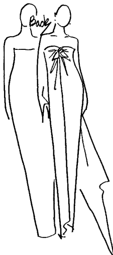
Halston, Drawing of Sarong dress, 1975.