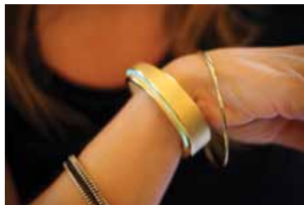
Beacon Et Lively, Latest Prototype, 2014.