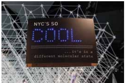
NYC's So Cool... from STORY's COOL Summer 2014 installation.