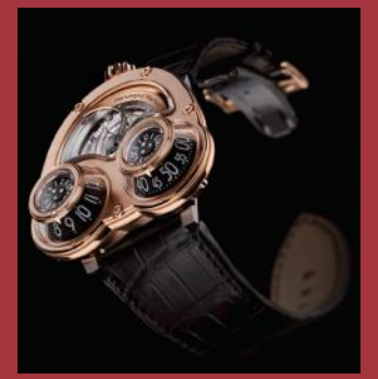
MB&EF, HM3 MegaWind , case in 18k red gold and titanium. Oversized "battle-axe" winding rotor in titanium and 22k gold, visible through a sapphire crystal. 270 components for the movement, 52 for the case.