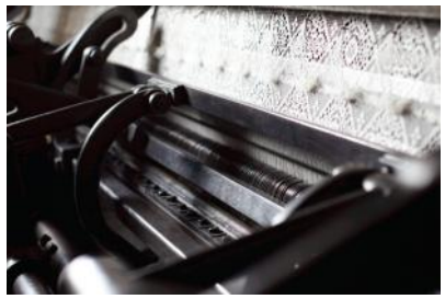
100-Year-Old Nottingham Lace Loom in Action at MYB Textiles.