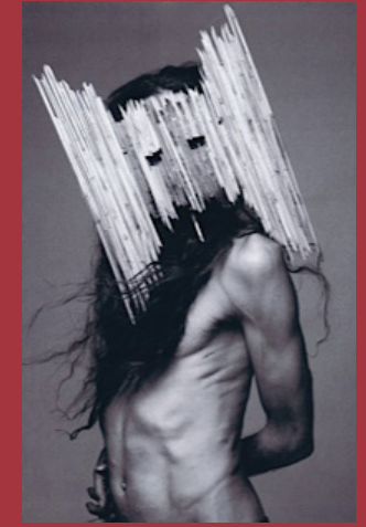
Sølve Sundsbø, Miguel Adrover for LOVE Magazine , 2013