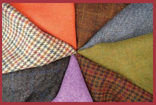
Selection of Harris Tweeds.