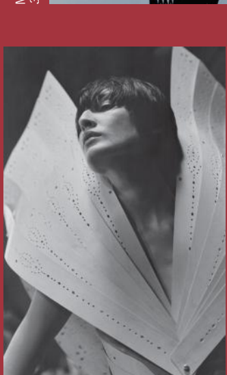
Anne Deniau, #13, September 1998 London, silver print © Anne Deniau.