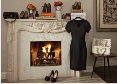
Project Gravitas, "Indira" Dress, Italian stretch cotton and silky noncompression bust with medium-control comfortable shapewear skirt lining.