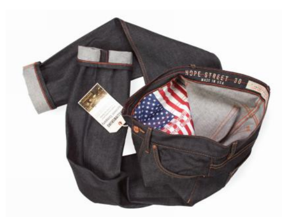
Williamsburg Garment Center. Hope Street: Made in USA.