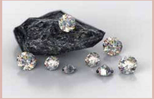
Group of Created Diamonds.