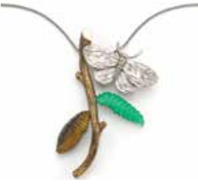
Jose Hess, Mariposa Necklace , 2015. Tree branch: silver with gold-brown PVD coating; caterpillar larva: green chrysoprase carving; pupa (chrysalis): tiger-eye carving; butterfly: platinum 950; chain: platinum 950.