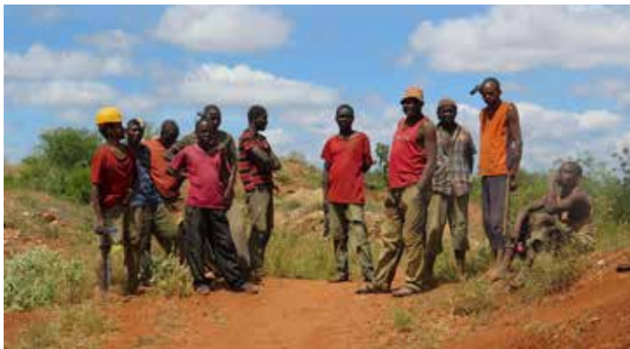
Miners in East Africa.