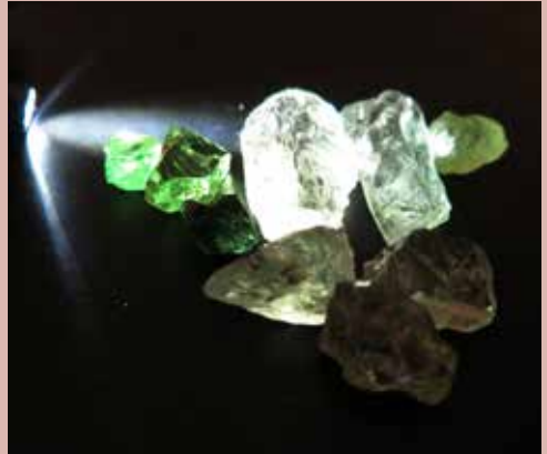
Green Garnets from Southern Kenya.

Single-day registration options available; please send inquiries to: info@artinitiatives.com or call (646) 485-1952.