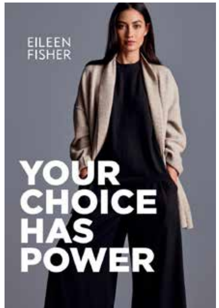
EILEEN FISHER advertisement, "Your Choice Has Power," Fall, 2016.