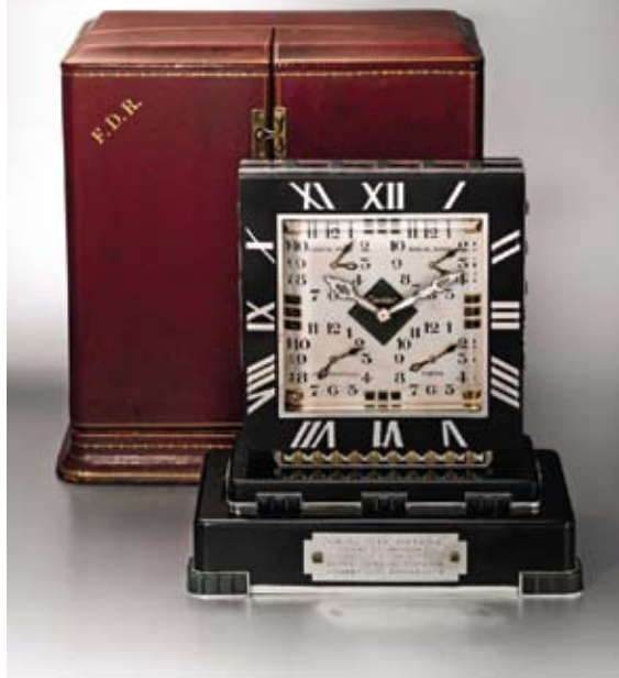
Cartier, The Franklin Delano Roosevelt Cartier Victory Clock, 1943, a silver, onyx and nephrite eight-day, five time zone desk timepiece presented to President Franklin Delano Roosevelt by Pierre Cartier on December 20th, 1943. To be sold in at Sotheby's New York on December 4th, 2007.