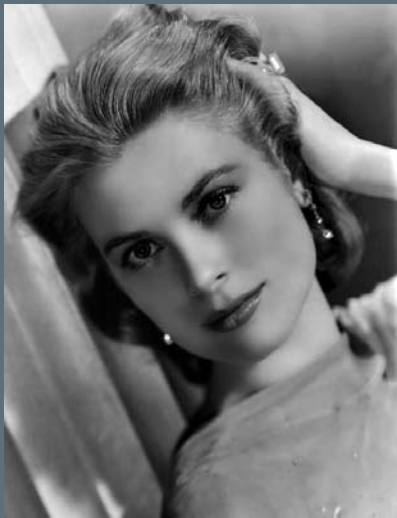
Grace Kelly, in High Society, 1956, director: Charles Walters; studio: Metro-Goldwyn-Mayer