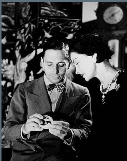
Verdura Showing his Cuff bracelet to Chanel, c. 1935