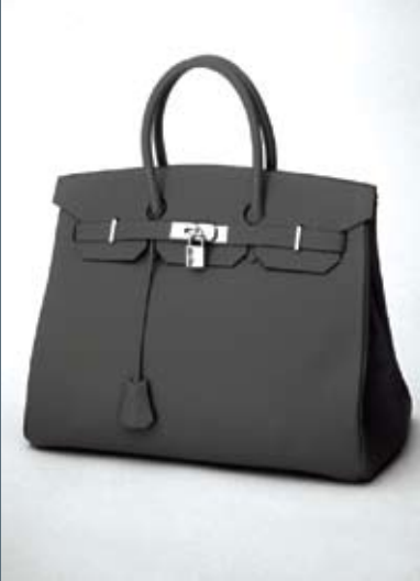
Hermès, Leather Birkin Bag, designed in 1984 and named for Jane Birkin