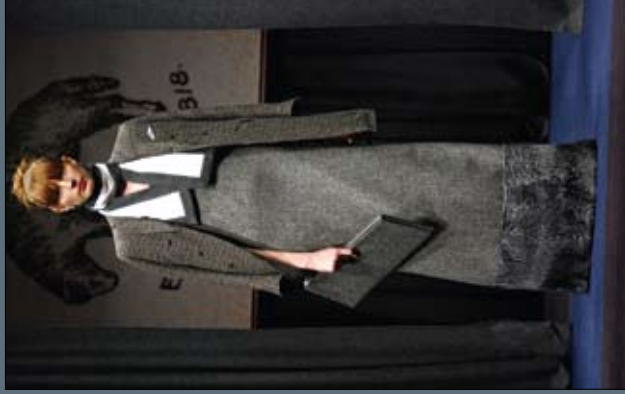
Thom Browne for Brooks Brothers Black Fleece, Woman's ensemble , Fall 2007