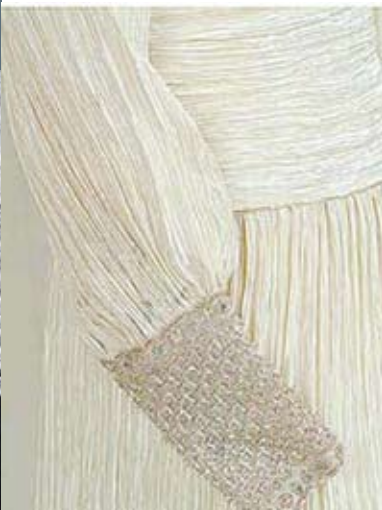
Mary McFadden, Wedding Dress Detail , with "Fortuny" pleating, gold thread embroidery, pearl/jewel-toned beadwork cuff. In collection of and photo: Historic Fashion Collection. Stephens College, Columbia, MO.