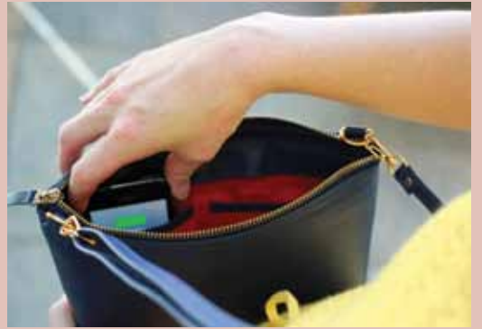
Everpurse. Charge your phone on the go...

Single-day registration options available; please send inquiries to: info@artinitiatives.com or call (646) 485-1952.