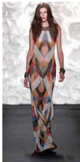
Naeem Khan, Dress, Spring / Summer 2015 Collection .