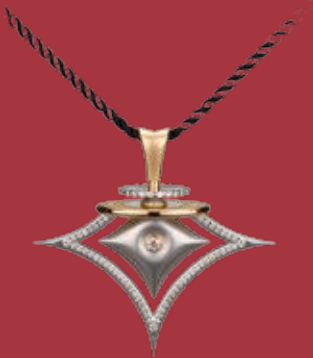
Steven Kretchmer, Town and Country Pendant ; platinum 950, platinum 777 (Polarium™), 18 kt gold, and diamonds.