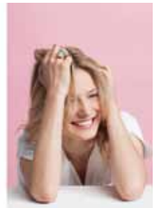
Ringly, "Emerald" Smart Ring.