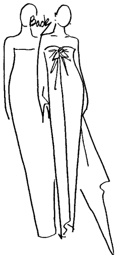
Halston, Drawing of Sarong dress, 1975.