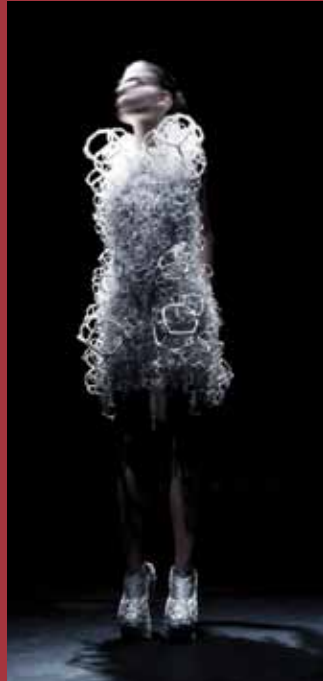
threeASFOUR (designed) in collaboration with Bradley Bothenberg (architect) and Materialise (fabricator), Revelation Dress , Collection Spring / Summer 2014; 3D-printed ivory resin, laser-sintered nylon.