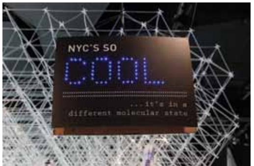
NYC's So Cool... from STORY's COOL Summer 2014 installation.