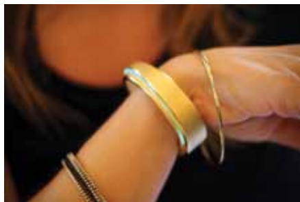
Beacon Et Lively, Latest Prototype, 2014.