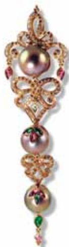
Paula Crevoshay, steward designer for the Cultured Pearl Association's documentary The Journey of the Pearl, Pendant/Pin , 2011; 18 kt gold with diamonds, garnets, tourmaline and 12-13mm bead nucleated natural color freshwater cultured pearls.