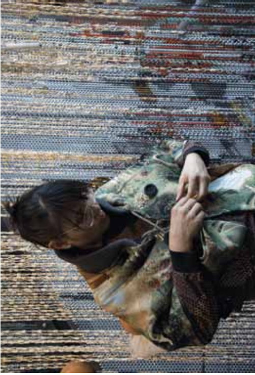
Bless, Orchestra Scarf , engineered by Popkalap, initiated by Sabine Scymour, 2013.

VISIONARY: Inspiration, Incubation, and Realization