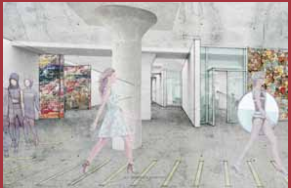
Rendering of Manufacture New York by Brooklyn-based architecture firm Ole Søndresen Architects.