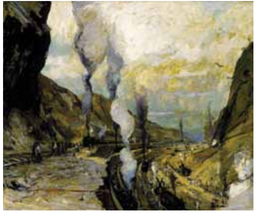
Jonas Lie, Culebra Cut , 1913, oil on canvas, 50 x 60 in. Detroit Institute of Arts, City of Detroit Purchase, 14.5.