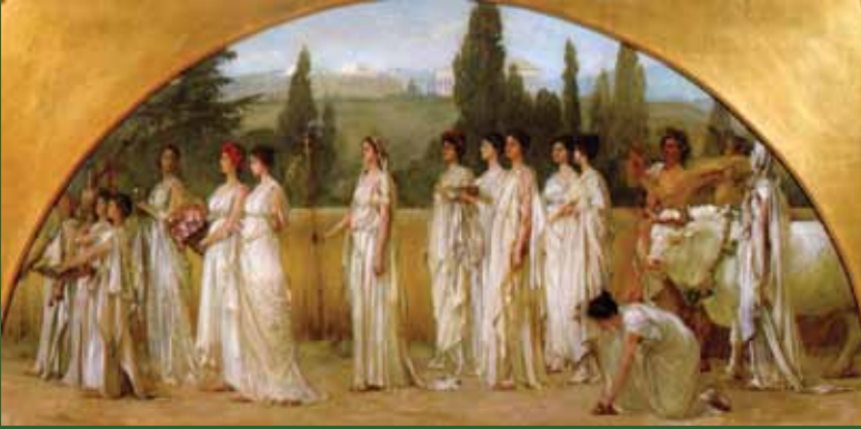
Francis Davis Millet, Study for Thesmophoria , 1897, lunette mural executed for the Bank of Pittsburgh. Brigham Young University Museum of Art.