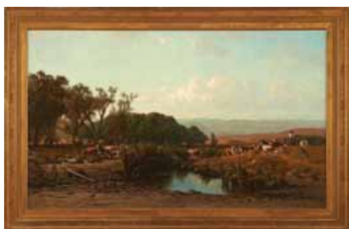
Thomas Hill, California , 1879, oil on canvas, 42 x 70¼ in. Private collection.