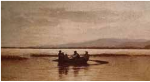
Louis Comfort Tiffany, A Family Row on the Hudson , ca. 1872. The New Jersey State Museum.