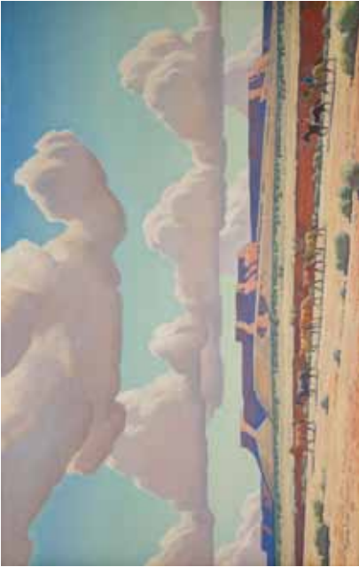
Maynard Dixon, Wide Lands of the Navajo , 1945, oil on canvas, 24 x 38 in. Denver Art Museum: The Roath Collection, 2013.100.

333 East 57th Street, Suite 13B New York, New York 10022