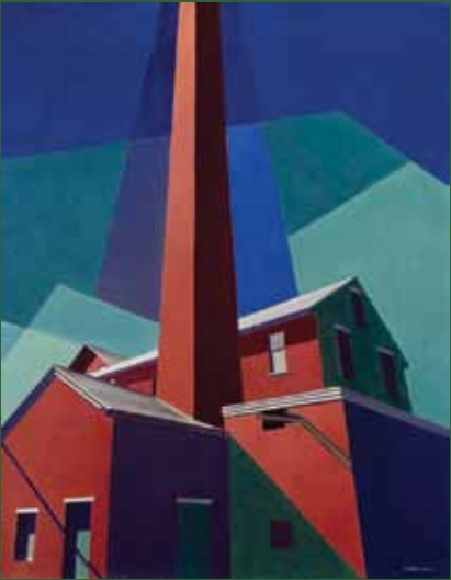
Charles Sheeler, Ballardvale , 1946, oil on canvas, 24 x 19 in. Addison Gallery of American Art, Andover, Massachusetts.