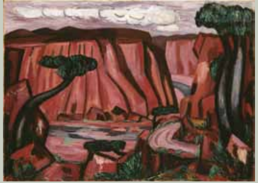
Marsden Hartley, New Mexico Recollection #6 , 1922, oil on canvas, 25¼ x 36½ in. Denver Art Museum: William Sr. and Dorothy Harmsen Collection, 2001.455.

Single-day registration options available; please send inquiries to: info@artinitiatives.com or call (646) 485-1952.