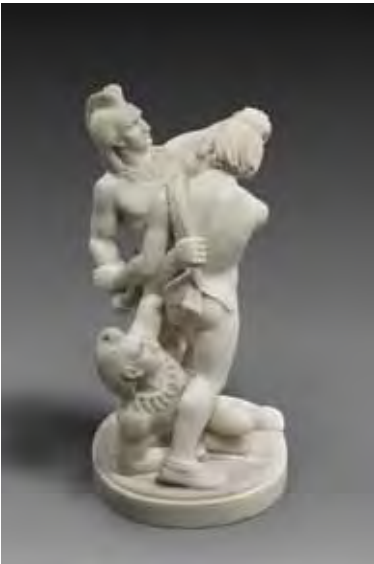
Edmonia Lewis, Indian Combat , 1868, marble, 30 x 19 x 14½ in. The Cleveland Museum of Art, American Painting and Sculpture Sundry Purchase Fund and purchase from the J.H. Wade Fund 2011.110.