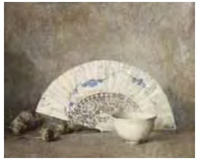
Emil Carlsen, The Fan , oil on canvas, 15¼ x 18¼ in. St. Louis Art Museum, Museum Purchase, 14:1919.

580 Madison Avenue (between 56th and 57th Streets)