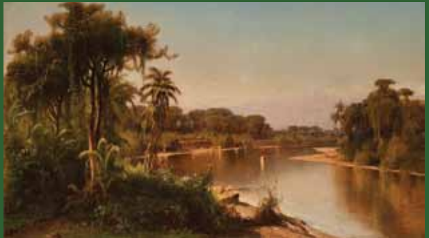
Henry A. Ferguson, South American Landscape , ca. 1870 – 1873, oil on canvas.