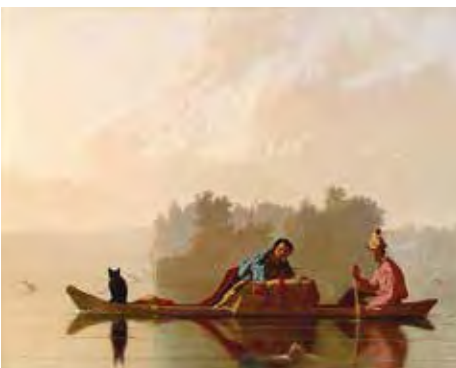
George Caleb Bingham, Fur Traders Descending the Missouri , 1845, oil on canvas, 29 x 36½ in. The Metropolitan Museum of Art, Morris K. Jesup Fund, 1933. 33.61.