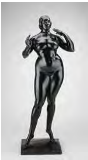
Gaston Lachaise, Woman (Elevation) [LF 55], model executed 1912 – 1915, © 1927, cast 1928, bronze, h 73 in; base, 1¾ ; 27 x 17 in. The Art Institute of Chicago, Friends of American Art Collection, 1943.580.