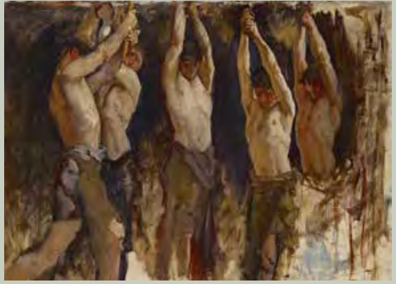
Edwin Austin Abbey, Men at an Anvil, Study for the Spirit of Vulcan, Genius of the Workers in Iron and Steel , c. 1904 - 1908, oil on canvas, capitol rotunda, Harrisburg, Pennsylvania, 1937. 1365.

Withdrawal and refunds: Notice of withdrawal must be made in writing to: Initiatives in Art and Culture, 333 East 57 th Street, Suite 13B, New York, NY 10022 or to the Program Office via e-mail at info@artinitiatives.com . No refunds will be made after May 5, 2016.