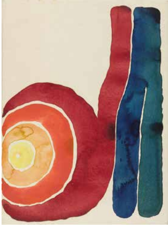
Georgia O'Keeffe, Evening Star, No. III , 1917, watercolor on paper mounted on board, 8 \frac{7}{8} x 11 \frac{1}{8} in. Museum of Modern Art, Mr. and Mrs. Donald B. Straus Fund, 91.1958.

Initiatives in Art and Culture 333 East 57th Street, Suite 13B New York, New York 10022