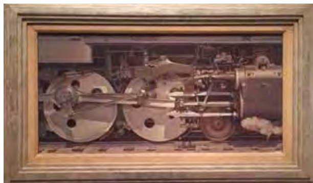
Charles Sheeler, Rolling Power , 1939, oil on canvas. Smith College Museum of Art, purchased with the Drayton Hillyer Fund, SC 1940.18.