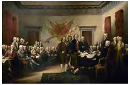
John Trumbull, The Declaration of Independence , 1818, oil on canvas completed; purchased 1819, placed 1826 in the Rotunda, United States Capitol, Washington DC.