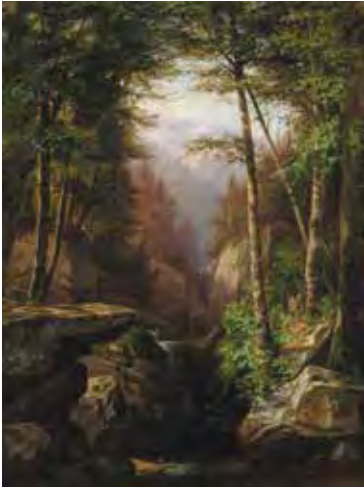
George Hetzel, Rocky Gorge , 1869, oil on canvas, 42 x 29 in. The Westmoreland Museum of American Art, Museum Purchase, 1980.33.