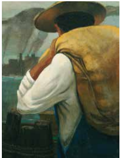
Joe Jones, Farmer with a Load of Wheat , 1936, oil on canvas, 24 x 18 1/2 in. D. Wigmore Fine Art.