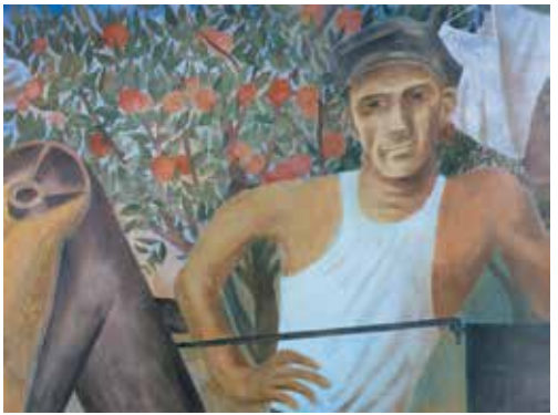
Ben Shaun, Harvesting Wheat, 1940, fresco, 33 x 44½ in.