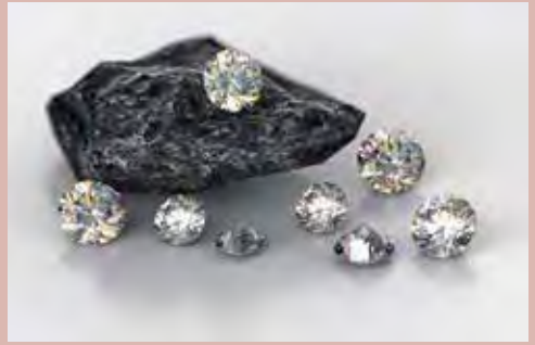
Group of Created Diamonds.