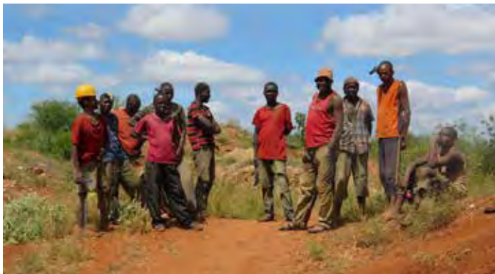
Miners in East Africa.