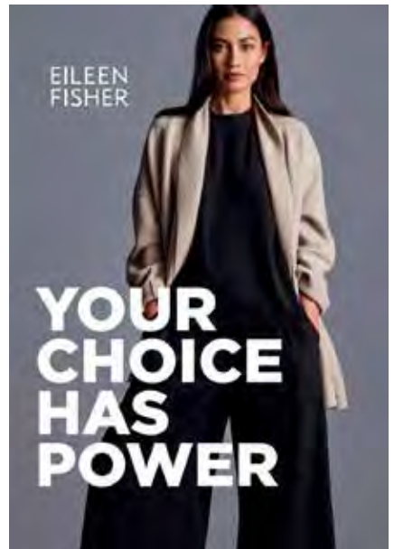
EILEEN FISHER advertisement, "Your Choice Has Power," Fall, 2016.