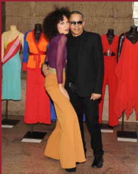
Pat Cleveland and Stephen Burrows at the Tribute to the Models of Versailles 1973 at The Metropolitan Museum of Art, January 23, 2016.

First. At the leading (or bleeding) edge. Pioneering . Surely an enviable, or at least admirable, position. But we know it don't come easy, and even when it comes, it doesn't guarantee success. But without pioneers, without those who risk being first (whatever the endeavor), we are stuck, frozen in place, our feet nailed to the floor.