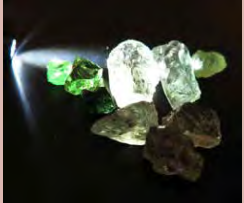
Green Garnets from Southern Kenya.

Single-day registration options available; please send inquiries to: info@artinitiatives.com or call (646) 485-1952.