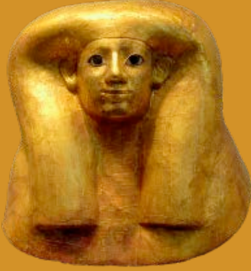
Egyptian Gilded Funerary Mask, ca. 1480 BC. The Metropolitan Museum of Art. 1936.3.1.

Taking a wide-ranging look at gold and with a focus on jewelry, IAC explores the underpinnings of gold's abiding emotional power, allure, and enduring value. IAC's Gold Conference annually brings together representatives from all communities and disciplines to engage in a multi-faceted exploration of the power and meaning of gold.