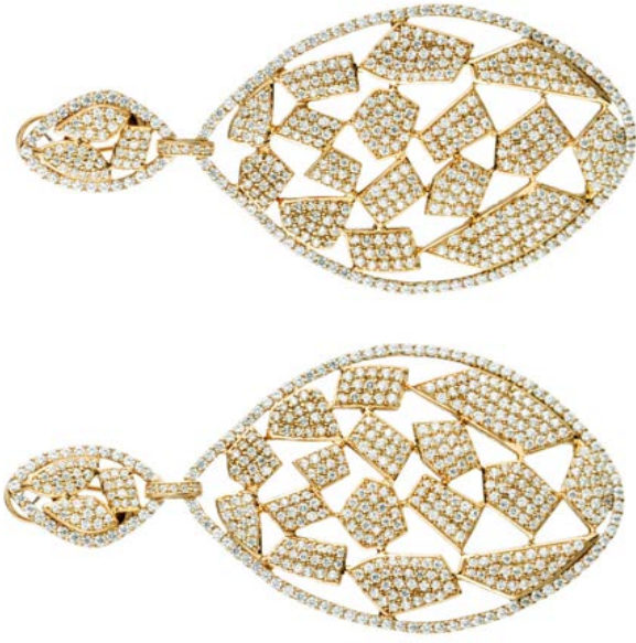
Kara Ross, New York Mosaic Earrings , 18 kt. yellow gold with diamonds.

333 East 57th Street, Suite 13B New York, New York 10022