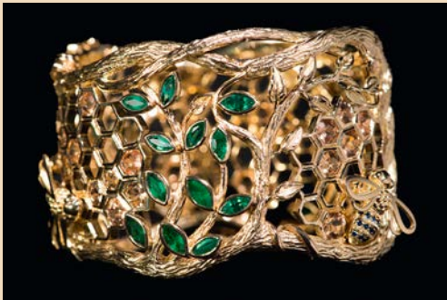
Temple St. Clair, The Bee Bracelet , 2016, from The Big Game , 18 kt. gold with Imperial topaz, Ceylon sapphire and diamond.