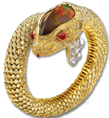
Nicholas Varney, Snake Cuff Bracelet , 18 kt. yellow gold, cognac and colorless diamond, fire opal and ruby cabochon.

AARON FABER GALLERY 666 Fifth Avenue (on 53rd Street between Fifth and Sixth Avenues)