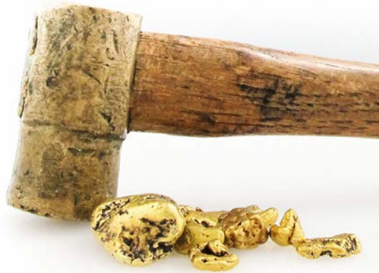
Brass Hammer and Raw Alluvial Gold (Gold Nuggets) from Alaska. Reproduced in Blair Lauren Brown Raw and Refined Jewelry Brand Book