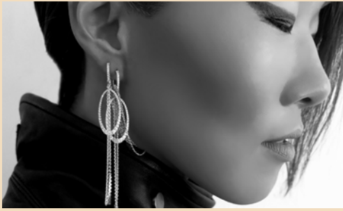
Simon Alcantara, White Gold and Diamond Pavé Hand Woven Chain Fringe Earrings .