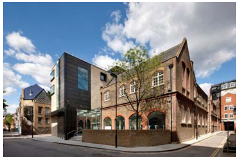
The Goldsmiths Centre.

Pippa Small, Assorted Jewellery, gold and rough gems in their natural state.