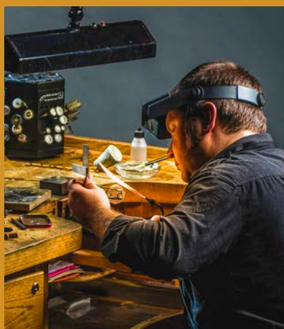
Jeweler at the Bench.