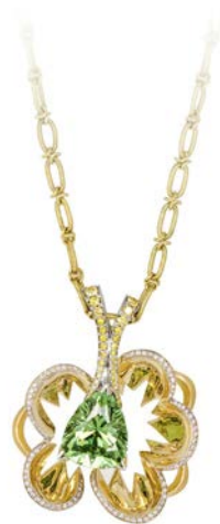
Mark Schneider, Pendant Created for Sharing the Rough Documentary , 18 kt. yellow gold and platinum featuring a 13.65 ct. shield shape mint green grossular garnet, 5.22 ct. bullet shaped red garnet, 0.425 ctw. white diamonds, and 0.70 ctw. natural fancy yellow diamonds.