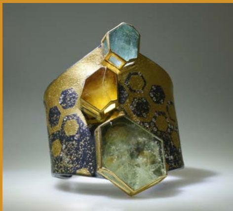
Peter Schmid "Nectar" cuff bracelet, 2016, 24 kt. gold on oxidized sterling, set with three large hexagonal green beryl, yellow beryl and blue beryl (aquamarine) gems, accented with diamonds; 2 1/2" x 3 1/4" x 1/2".