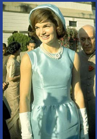
Art Rickerby, Jacqueline Kennedy , 1962.