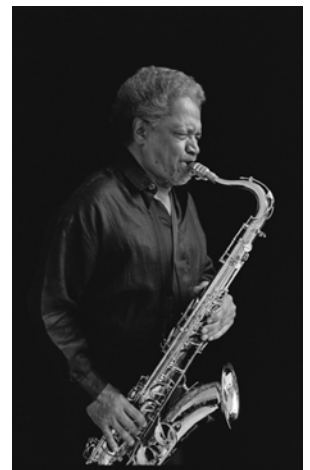
Arthur Elgort, Illinois Jacquet , New York City, 1991.