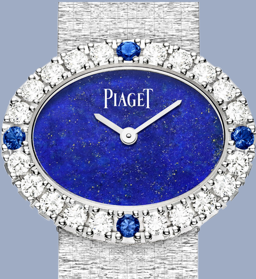
Piaget, Altiplano Stone Dial Watch , diamond and sapphire bezel.

Conference location: Formal sessions take place at The New School, University Center, 63 5th Ave, New York, NY.