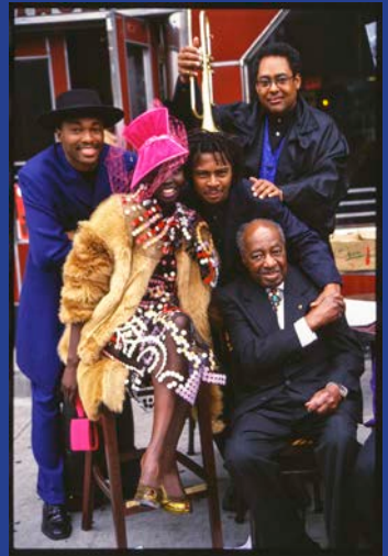
Arthur Elgort, Milt Hinton, Jon Faddis, Roy Hargrove, and James Carter , New York City, 2000.