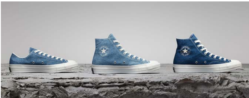
Converse, Renew Denim Chucks , one-of-a-kind Chuck 70s created using up cycled denim from hand-selected jeans.