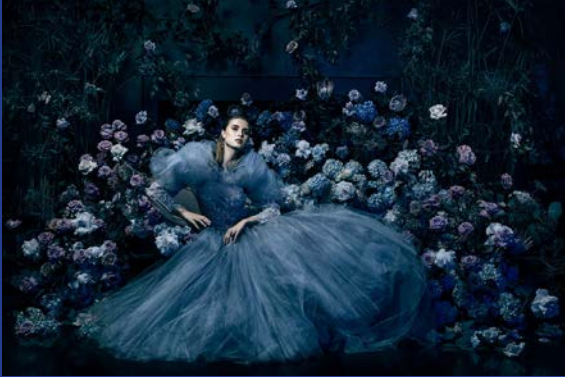
CELESTINO, Couture , 2018.

THURSDAY – SATURDAY, NOVEMBER 14 – 16, 2019