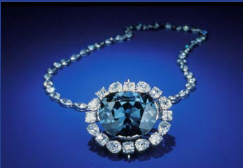
Hope Diamond , 45.52 carats, 25.60 mm x 21.78 mm x 12.00 mm. The pendant surrounding the blue Hope diamond features 16 pear-shaped and cushion cut white diamonds and the necklace chain features 45 white diamonds. National Museum of Natural History, The Smithsonian Institution.