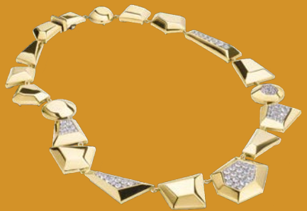
Mimi So, Gold Jackson Necklace , handcrafted in 18 kt yellow gold and diamonds.