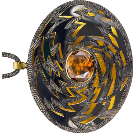
Alan Craxford, Golden Lightening , silver hand engraved, hand pierced, mirror behind to reflect the underside, stone oval Zircon in orange / brown, set in 18 kt gold.

Initiatives in Art and Culture 333 East 57th Street, Suite 13B New York, New York 10022