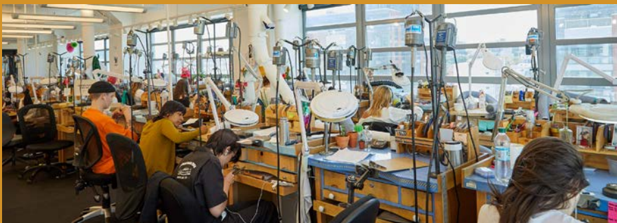
Catbird Studio , Brooklyn, NY.