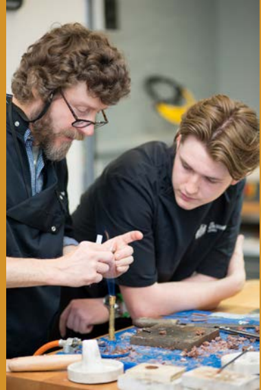
Students learn from established craftspeople on the Foundation Programme course.

The more we travel in realms of gold, the more we are confronted by urgent challenges at all points along the continuum from extraction through design and fabrication to sale or investment. And the more we travel these realms, the more we realize that our solutions to these challenges must be driven by respect for materials, craft, and authentic expression, and a commitment to ethical sourcing and responsible practice. This year's International Gold Conference brings together a Who's Who in the gold community, including makers, miners, retailers, journalists, financiers, regulators, and environmentalists, in a tour d'horizon of this precious metal, focusing on specific, contemporary challenges along the golden continuum and how we can best meet them.