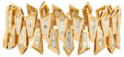
Stephen Webster, Dynamite Shattered Bracelet , 18 kt yellow gold, tapered baguette cut and trilliant cut white diamonds (6.70 carats).