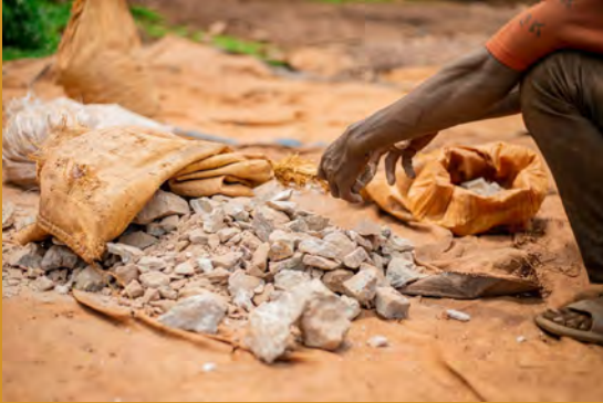
USAID's Zahabu Safi (Clean Gold) project launches refiners community of practice to help set up responsible gold supply chain from Eastern DRC. Photo: globalcommunities.org/press-releases (May 27, 2022).