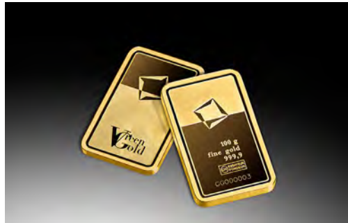
100-gram Green Gold bar.