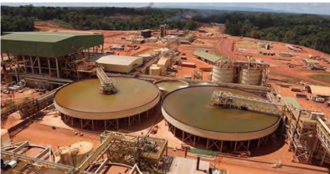
Merian Goldmine of Surgold, Newmont Suriname.