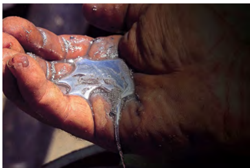
Elemental mercury.