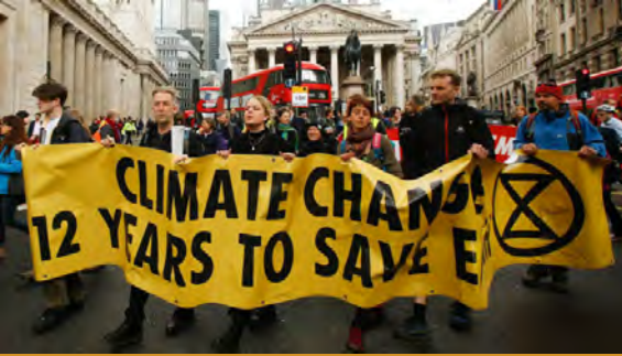
Activists march in London on April 2020 (activists from the Extinction Rebellion group demonstrating during protests outside the Bank of England.).

MONDAY – WEDNESDAY, JULY 18 – JULY 20, 2022