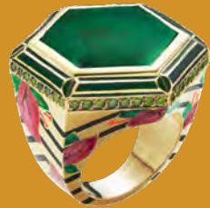
Alice Ciccolini, Jaipur Bougainvillea Ring (2018). Photo: @Alice Ciccolini.