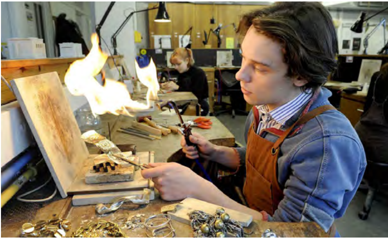
Students in the workshop at The Scottish Radical Jewelry Makeover (December 2021).