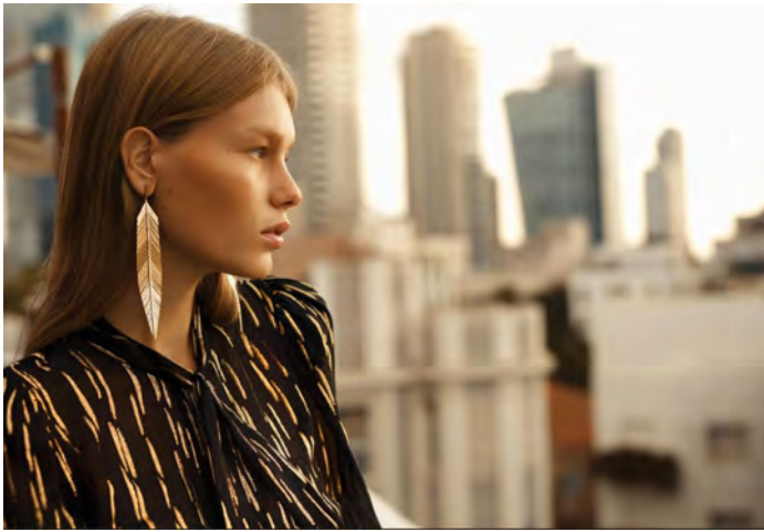
CADAR, Large gold feather earrings on model.