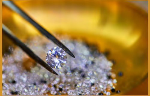
Diamond held by tweezers against background of diamonds in fixer plate.