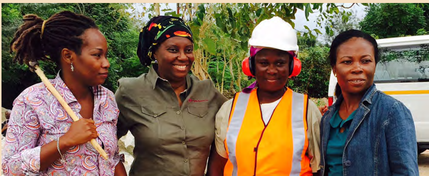
The ladies at work.

Conference location: Formal sessions take place at Bohemian National Hall, 321 E. 73rd St., New York, NY.