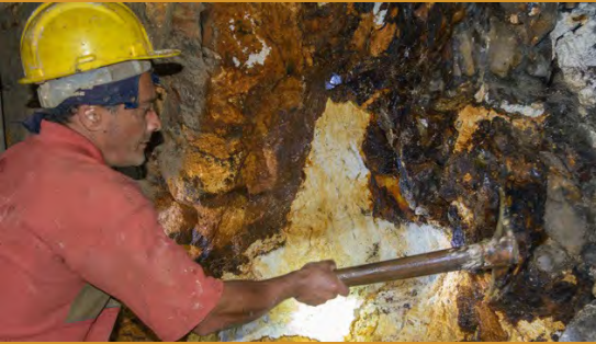
Miner harvesting tourmaline from the Cruzeiro Mine in Minas Gerais, Brazil.