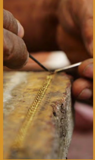
Artisanal Colombian goldsmith at work on gold chain.