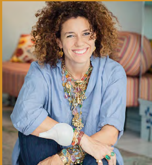
Jewelry designer Pippa Small.