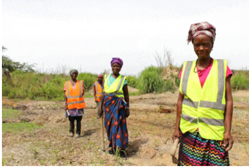
Villagers cultivating land at abandoned mined pits being brought back to productive use in Kono District, Sierra Leone.