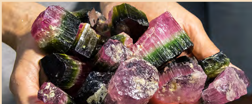
Handful of multicolored crystals ranging from rubellite to green with black terminations from Cruzeiro Mine, Minas Gerais, Brazil.

Conference location: Formal sessions take place at Bohemian National Hall, 321 E. 73rd St., New York, NY.