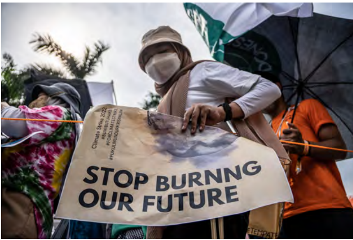
Indonesians joining Global Climate Strike in Jakarta, Friday, 23 September 2022.