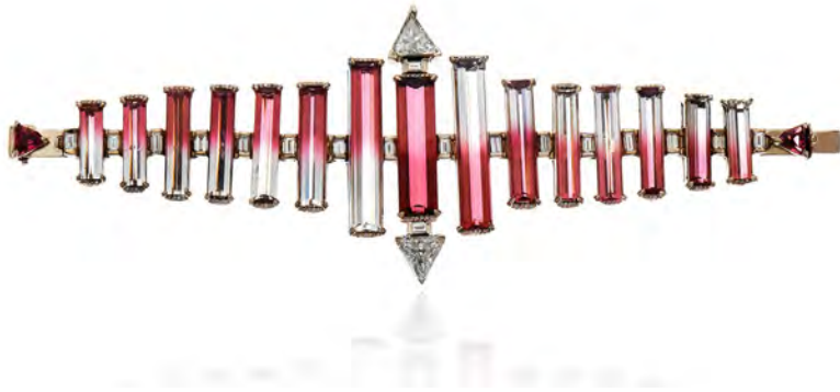
Fizman Jewel Studio, bracelet featuring 96.35 carats of bi-color tourmaline and 6.55 carats of diamonds in 18-karat gold.