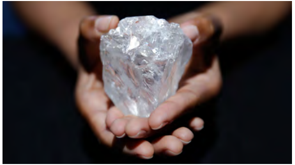
Lesedi la Rona diamond, 1,109-carat rough stone found in Botswana, November 2015.